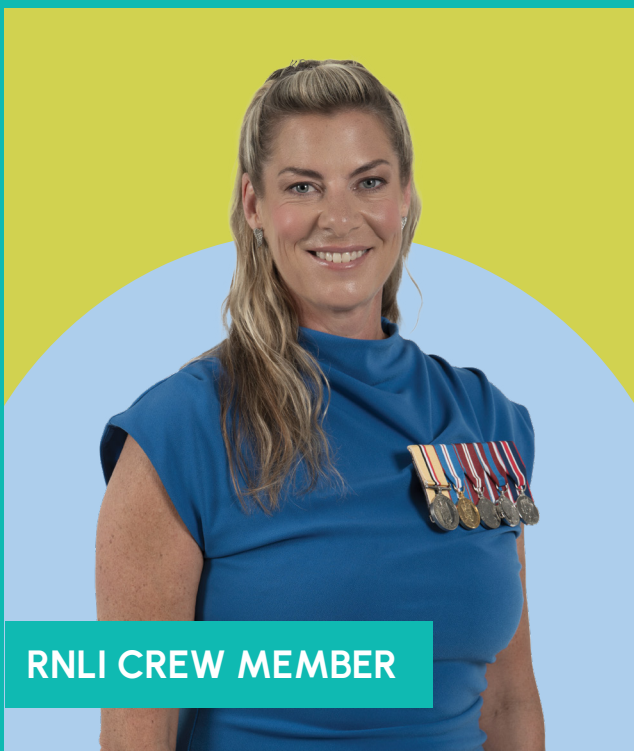
RNLI CREW MEMBER