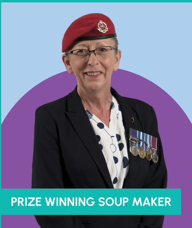
PRIZE WINNING SOUP MAKER