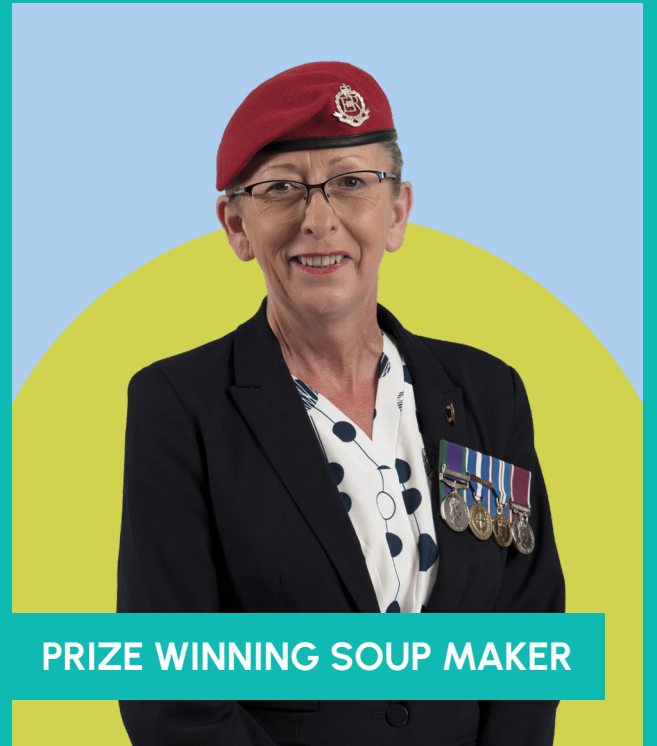
PRIZE WINNING SOUP MAKER