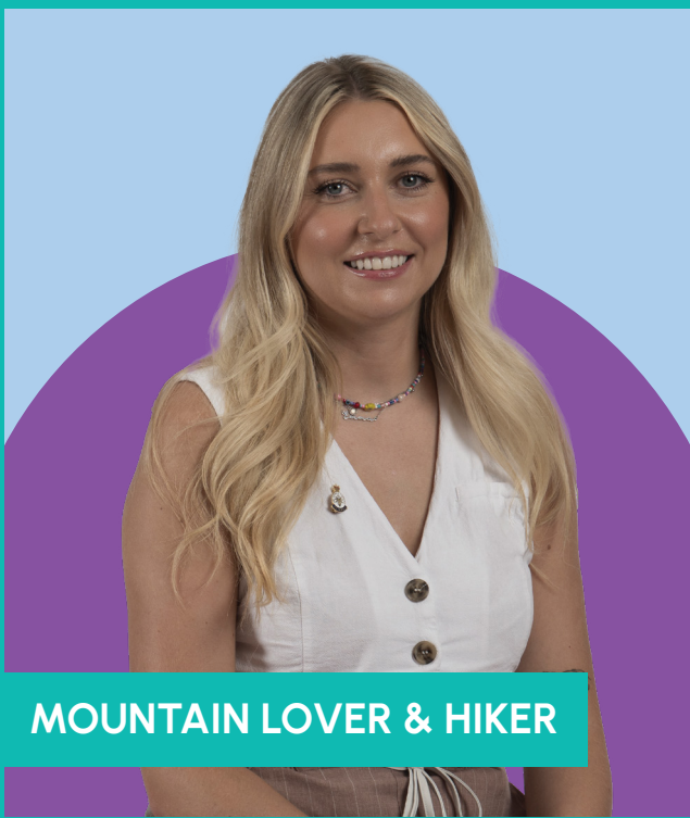
MOUNTAIN LOVER & HIKER