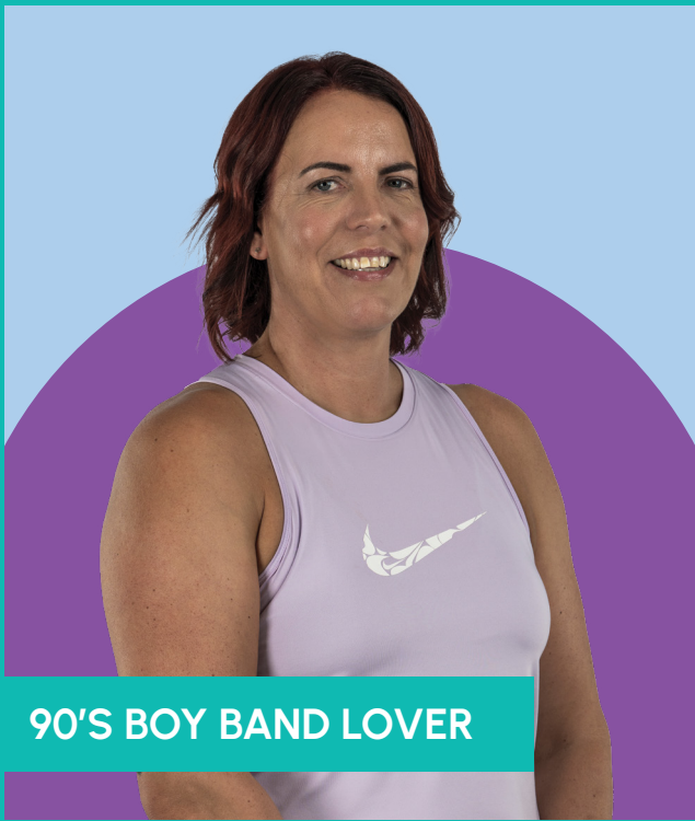
90'S BOY BAND LOVER