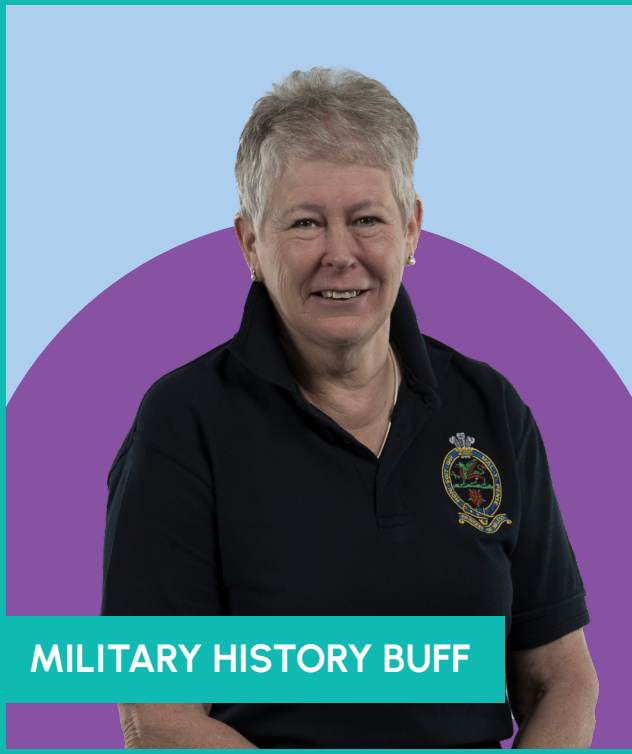
MILITARY HISTORY BUFF