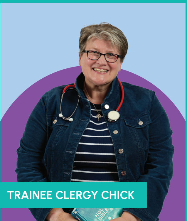
TRAINEE CLERGY CHICK