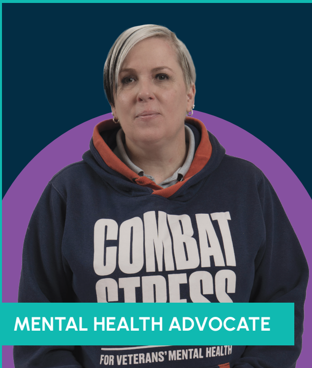
MENTAL HEALTH ADVOCATE