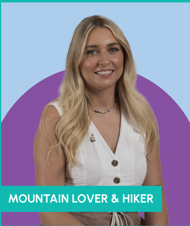
MOUNTAIN LOVER & HIKER