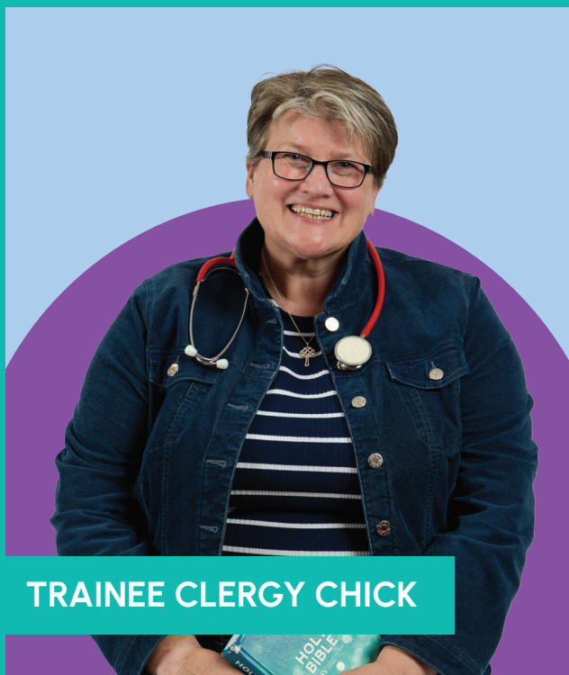
TRAINEE CLERGY CHICK