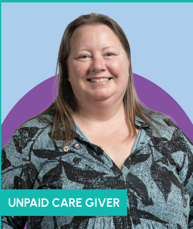
UNPAID CARE GIVER