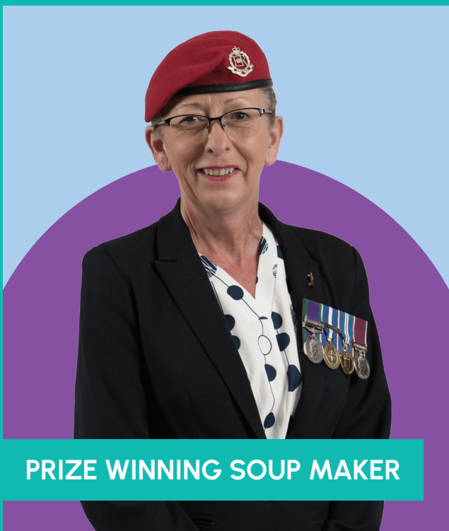
PRIZE WINNING SOUP MAKER