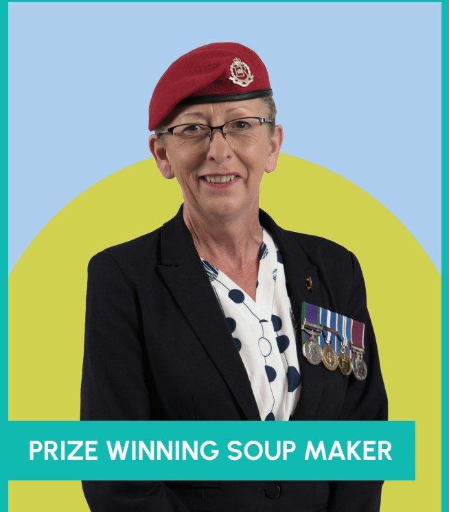
PRIZE WINNING SOUP MAKER