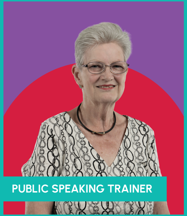
PUBLIC SPEAKING TRAINER