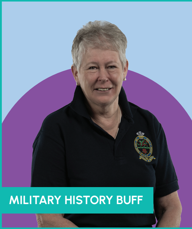
MILITARY HISTORY BUFF