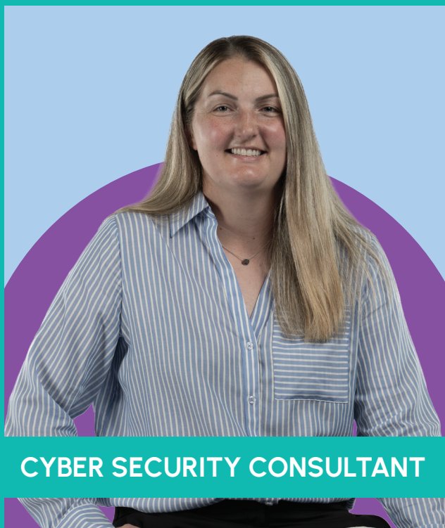
CYBER SECURITY CONSULTANT