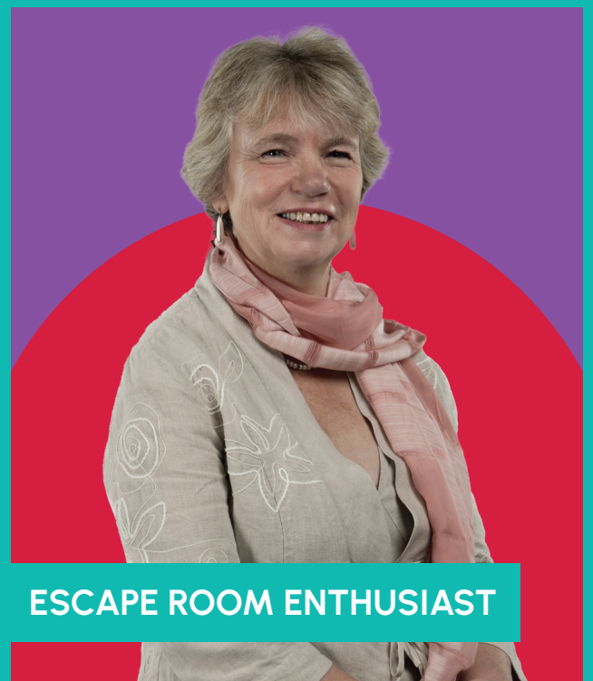
ESCAPE ROOM ENTHUSIAST