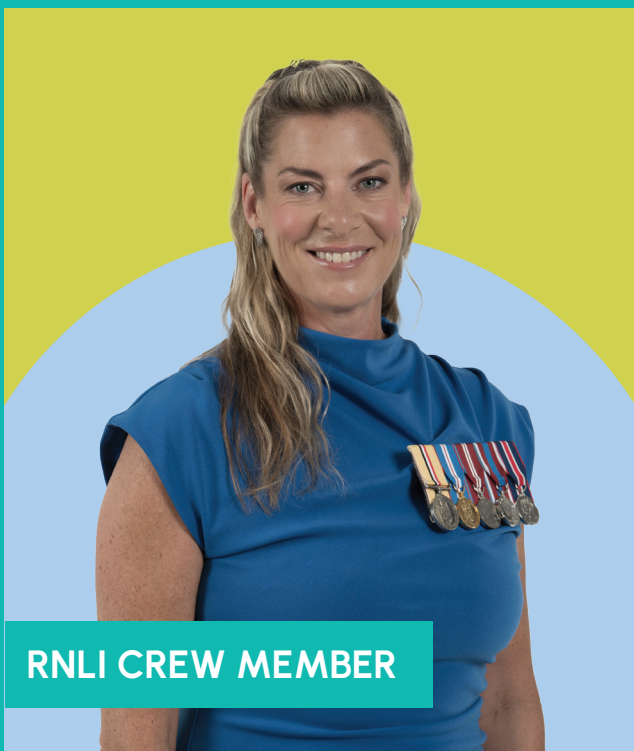
RNLI CREW MEMBER