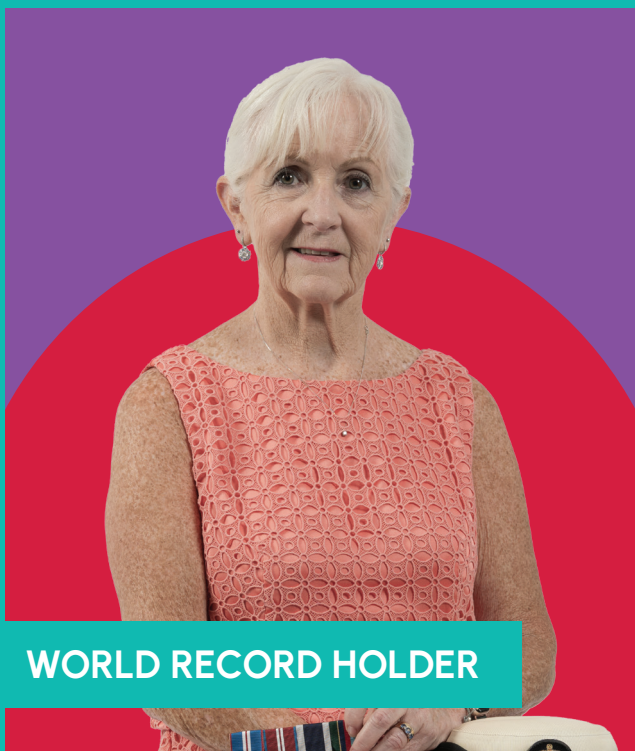
WORLD RECORD HOLDER