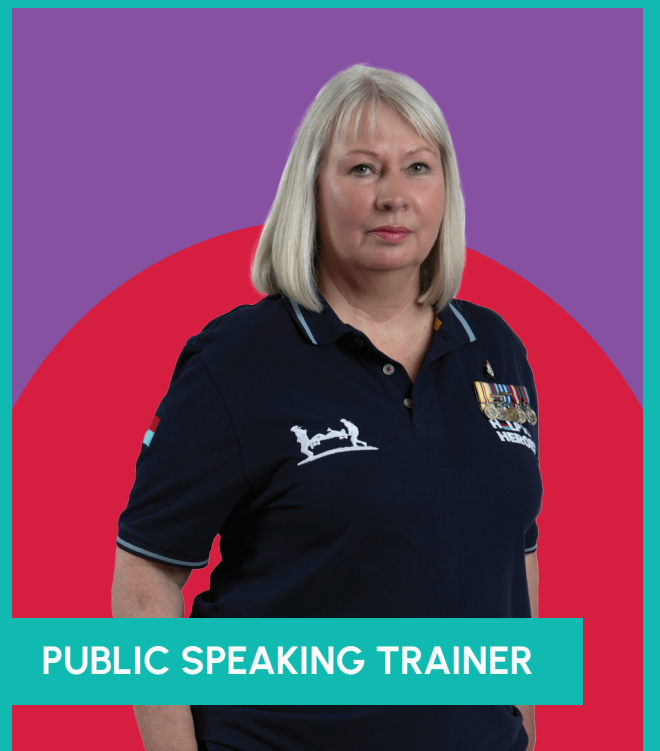
PUBLIC SPEAKING TRAINER